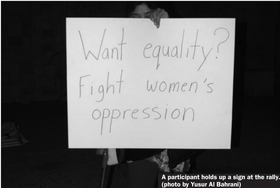
A participant holds up a sign at the rally.