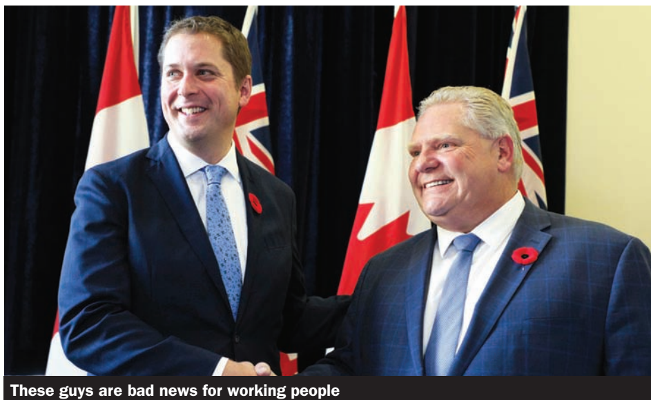
These guys are bad news for working people

Intimidation and uttering threats: Cuts to services for families dealing with autism provided early proof of their moral depravity. Not only did budget cuts deprive thousands of