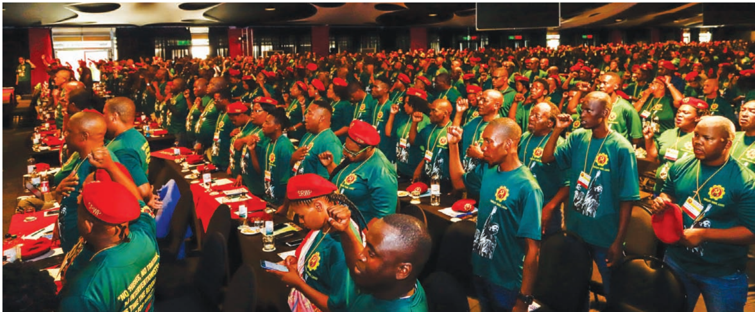
We stand for revolution—we are for socialism

Previously strong supporters of the South African Communist Party,