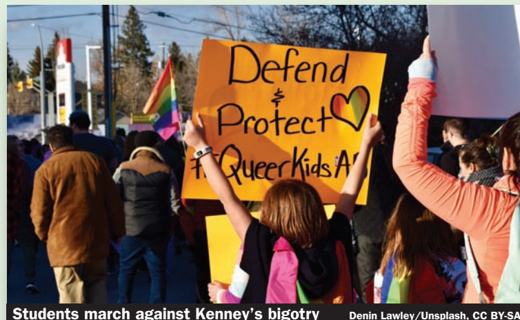
Students march against Kenney’s bigotry

prosperity pitch was enough to convince voters who have been facing job loss and high cost of living. Rachel Notley’s NDP