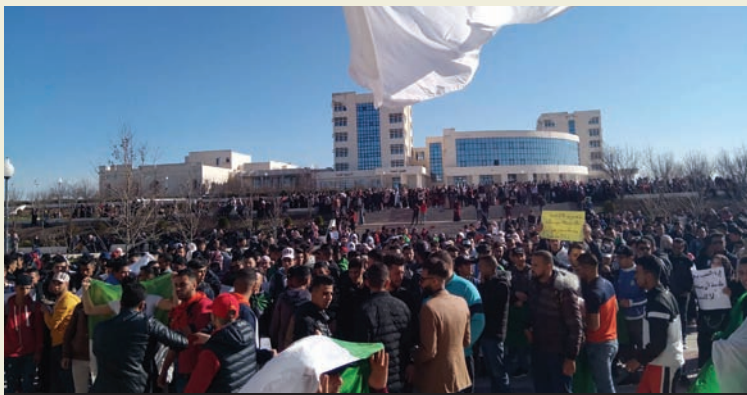
Algerian teachers spark uprising

School teachers’ unions were at the forefront of the strike waves which shook the country in the run-up to the eruption of the mass movement that toppled long-standing president Abdelaziz Bouteflika on 2 April. In 2016 teachers on temporary contracts organised a 250km protest from Béjaïa to Algiers to highlight their precarious working conditions and the chronic under-funding of state schools. Ordinary people in the towns and villages en route turned out to provide