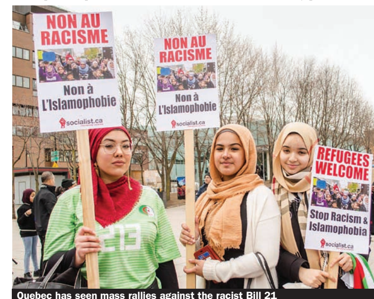
Quebec has seen mass rallies against the racist Bill 21

What we need is for all anti-racists across the Canadian state to shut down hate and show solidarity wherever we are.