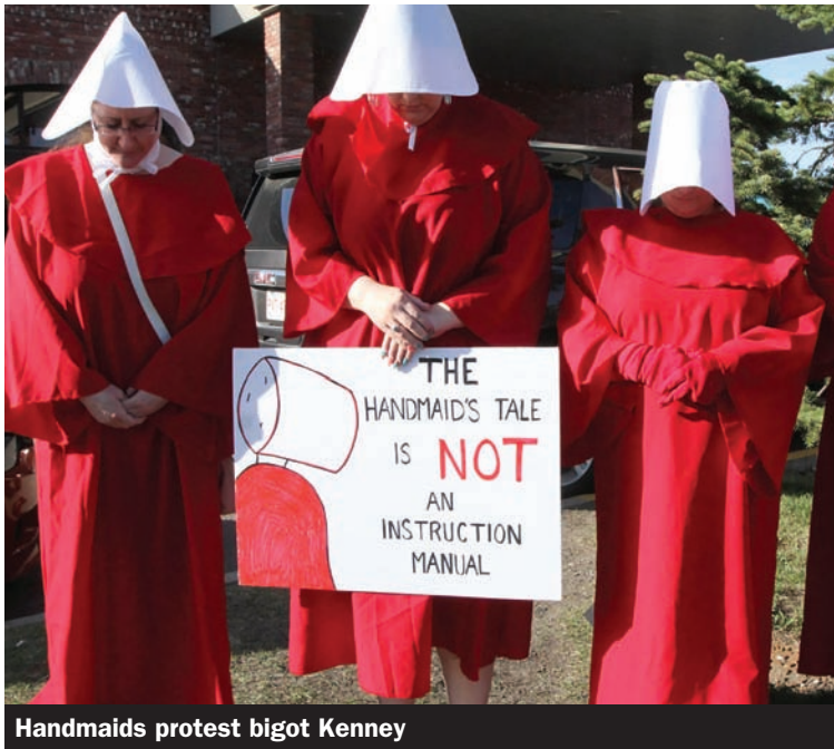
Handmaids protest bigot Kenney