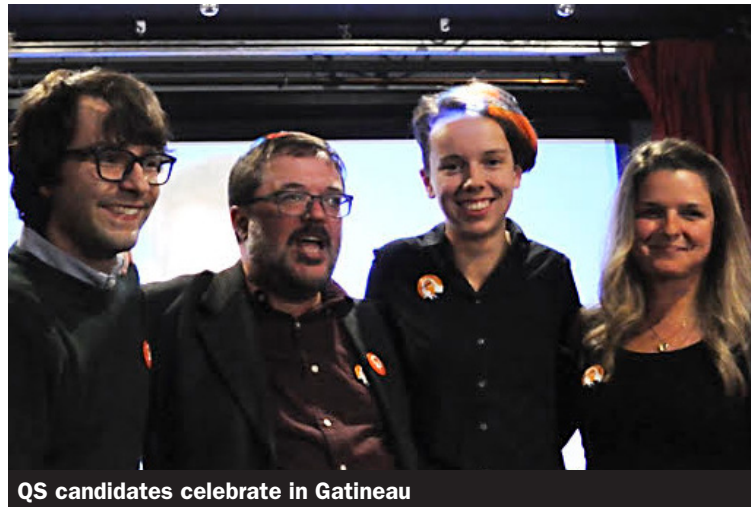
QS candidates celebrate in Gatineau

change front and centre and the other three parties had to try and match the ambitious program that QS put forward. The CAQ, which had been talking about support for fracking suddenly stopped mentioning that and tried to put their own energy policy on the back burner.