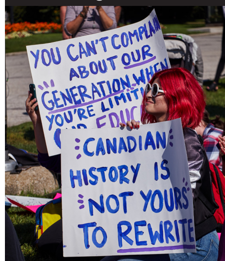
Some students marched to Queens Park to join the rally at the legislature