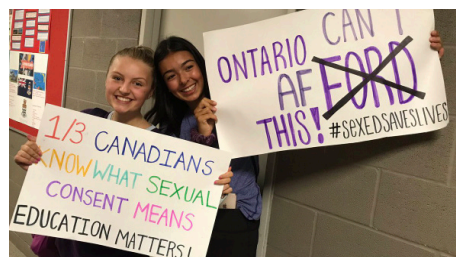
Hundreds joined the protest at Northern Collegiate in Toronto

The Ford government is using this cancellation to appeal to far right, bigoted voters who object to frank discussions about gender identity and same sex relationships. This evangelical base was central to Ford's election victory and to his leadership bid for the Conservative party.