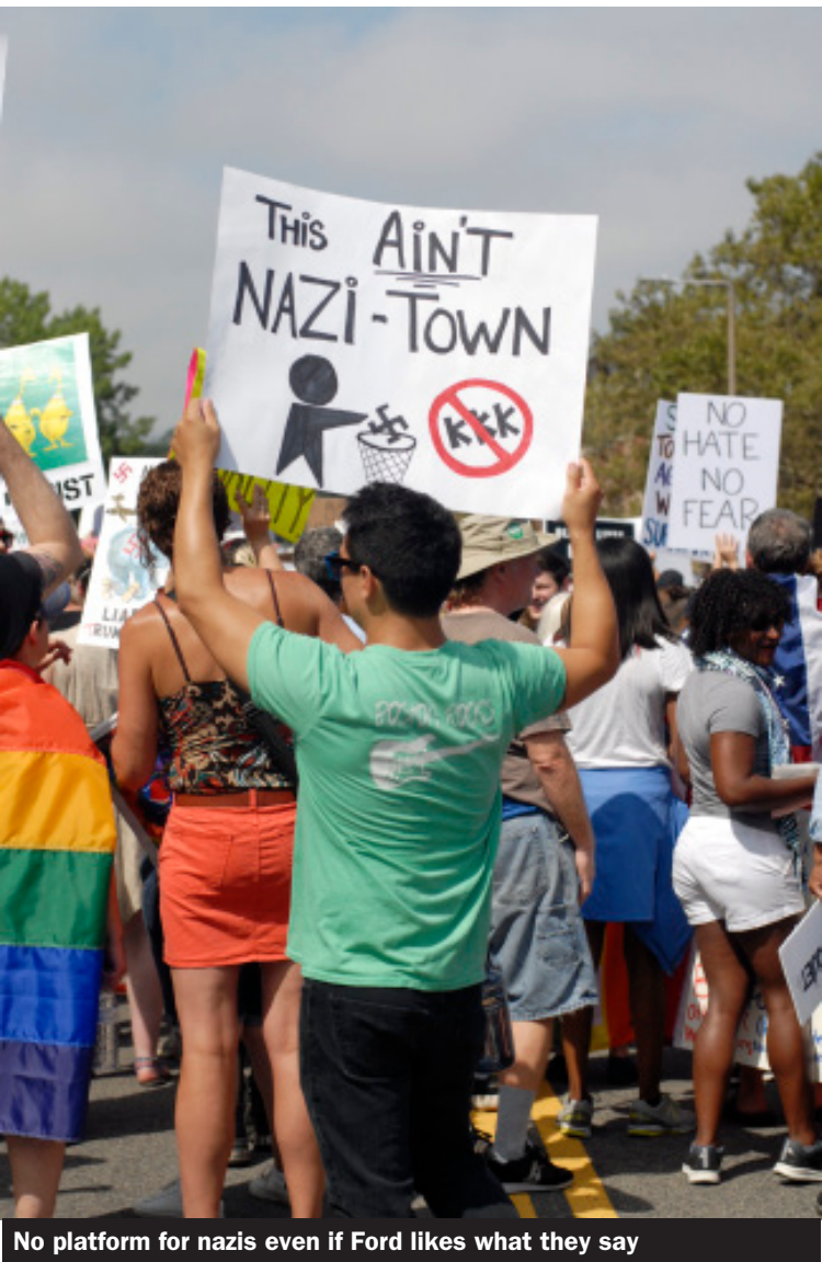
No platform for nazis even if Ford likes what they say

Further, the second point is a fundamental misunderstanding of the role of protest. Political protests are by their nature meant to be disruptive. The freely expressed message by the attendees is usually “we oppose this”—like protests that drove white supremacist Faith Goldy off campus. Ford is attempting to hamstring the ability of politically organized students to push against what they find unacceptable on campus. Compliance with this will turn opposition meek, and allow fringe ideologies which would have never flourished on campus to find a stable home. Ford’s “free speech” dog whistling to the alt-right is transparent enough, hav-