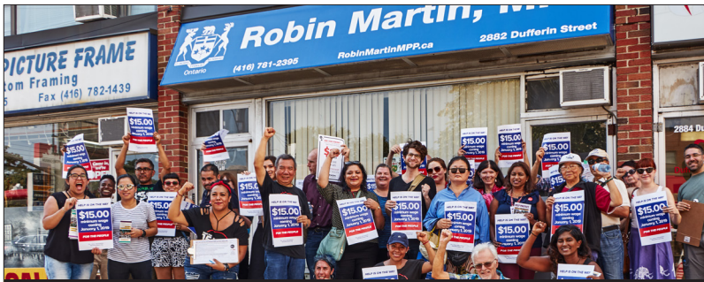
Campaigners take the fight to the Tories

Spontaneous demonstrations occurred at Queens Park when the government was cutting the number of seats at Toronto City council from forty seven to twenty five. Five hundred people lined up at midnight to get into the chambers when Doug Ford insisted that the legislature meet during the night. Residents were led out in handcuffs as they disrupted the proceedings. As Desmond Cole was quoted in the National Observer, "If Torontonians are waiting for some higher power to stop this attack on our city, we'll wait in vain: we have to stand up for ourselves, because no one else is coming to save us."