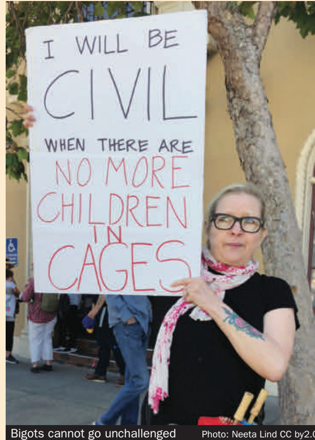
Bigots cannot go unchallenged

The far-right is on the march around the world, happy to use the gullibility of what they sneeringly call “normies” to amplify their message. We cannot let racists and bigots go unchallenged.