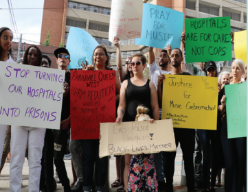
Demand answers from the cops