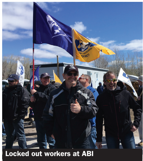
Locked out workers at ABI

the tariffs are not coming from a position of strength. The US is willing to alienate long time allies such as Canada and the European Union to win internal arguments at home. It has imposed a 25% tariff on steel and 10%