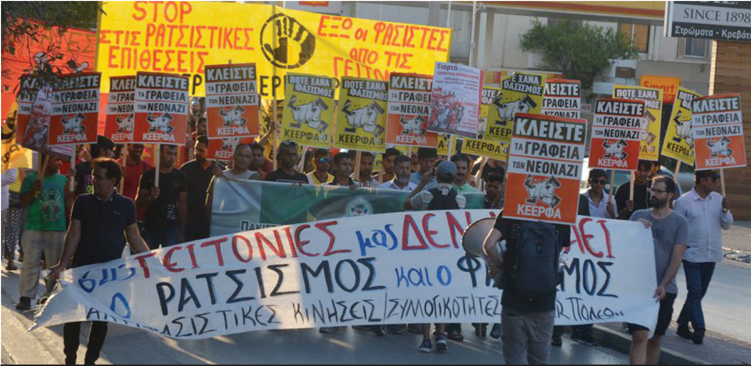
Greek Anti-Fascists on the march against Golden Dawn

Golden Dawn has joined rallies organised by New Democracy