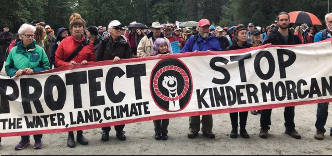
Blockade at the Burnaby pipeline terminal June 30th

Chrétien’s Liberals were an enthusiastic pro-war party throughout the 1990s, just as the Trudeau Liberals back tar sands expansion today. In