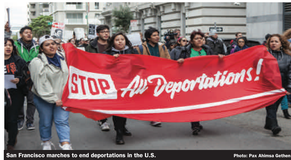
San Francisco marches to end deportations in the U.S.