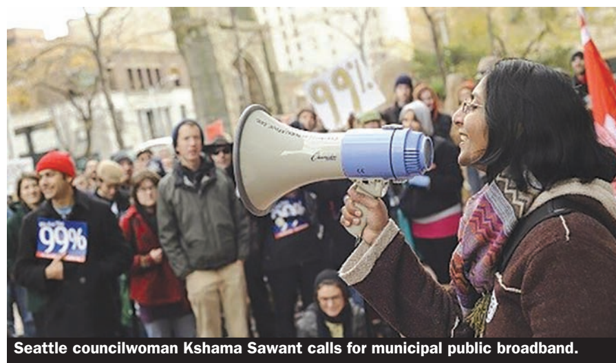
Seattle councilwoman Kshama Sawant calls for municipal public broadband.

The net neutrality repeal poses larger political problems as well. In 2005 Telus blocked access to a pro-union website during a dispute, and blocked 766 other sites to achieve this. This is now legal in the US. Movements