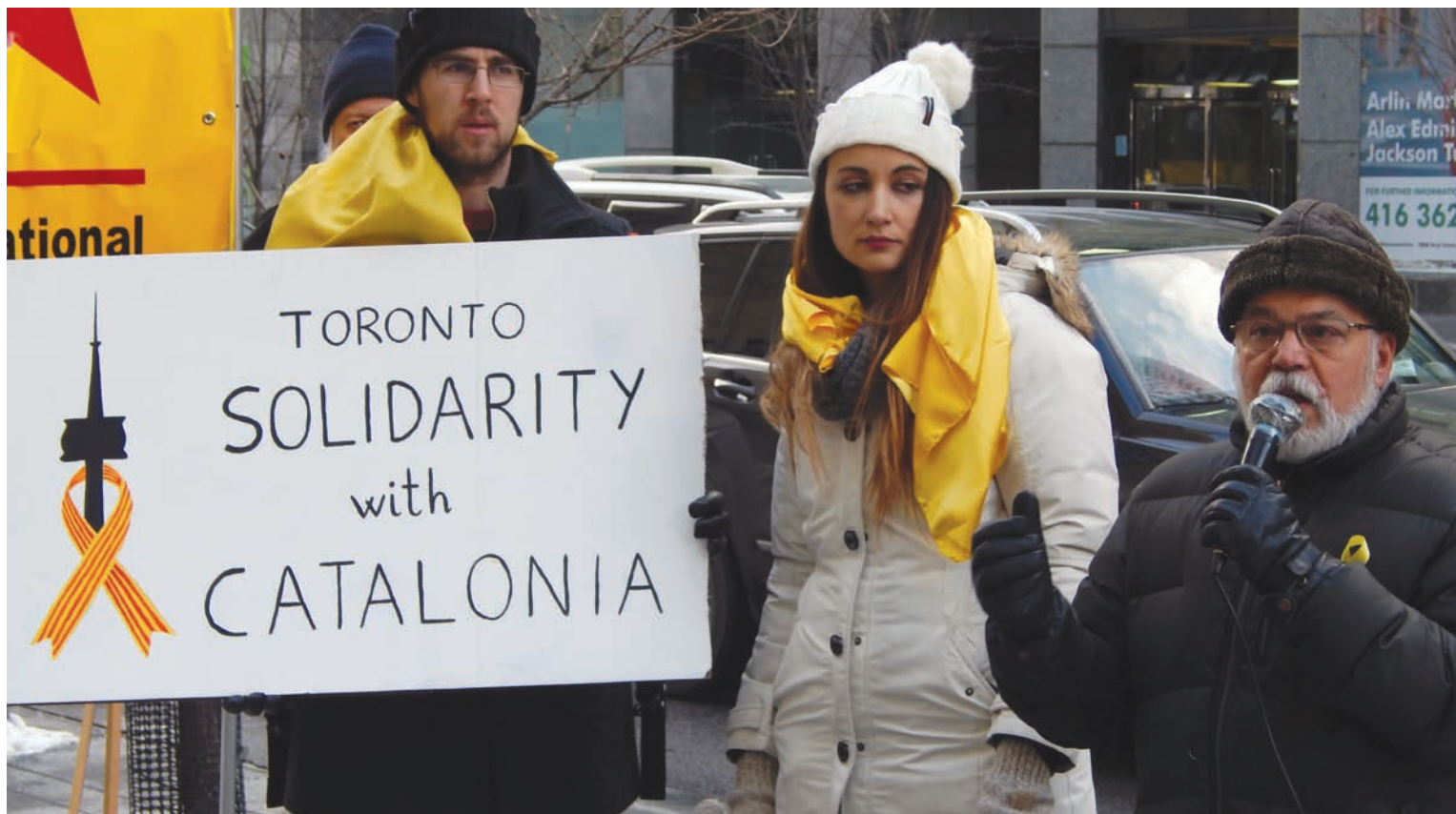
Solidarity mobilization in Toronto before the December 21st election in Catalonia

What we've seen in Catalonia over the last few months is the bourgeoisie in action when its interests are at stake. Nobody in a country without this specific historic element of Francoism should think their ruling class would behave