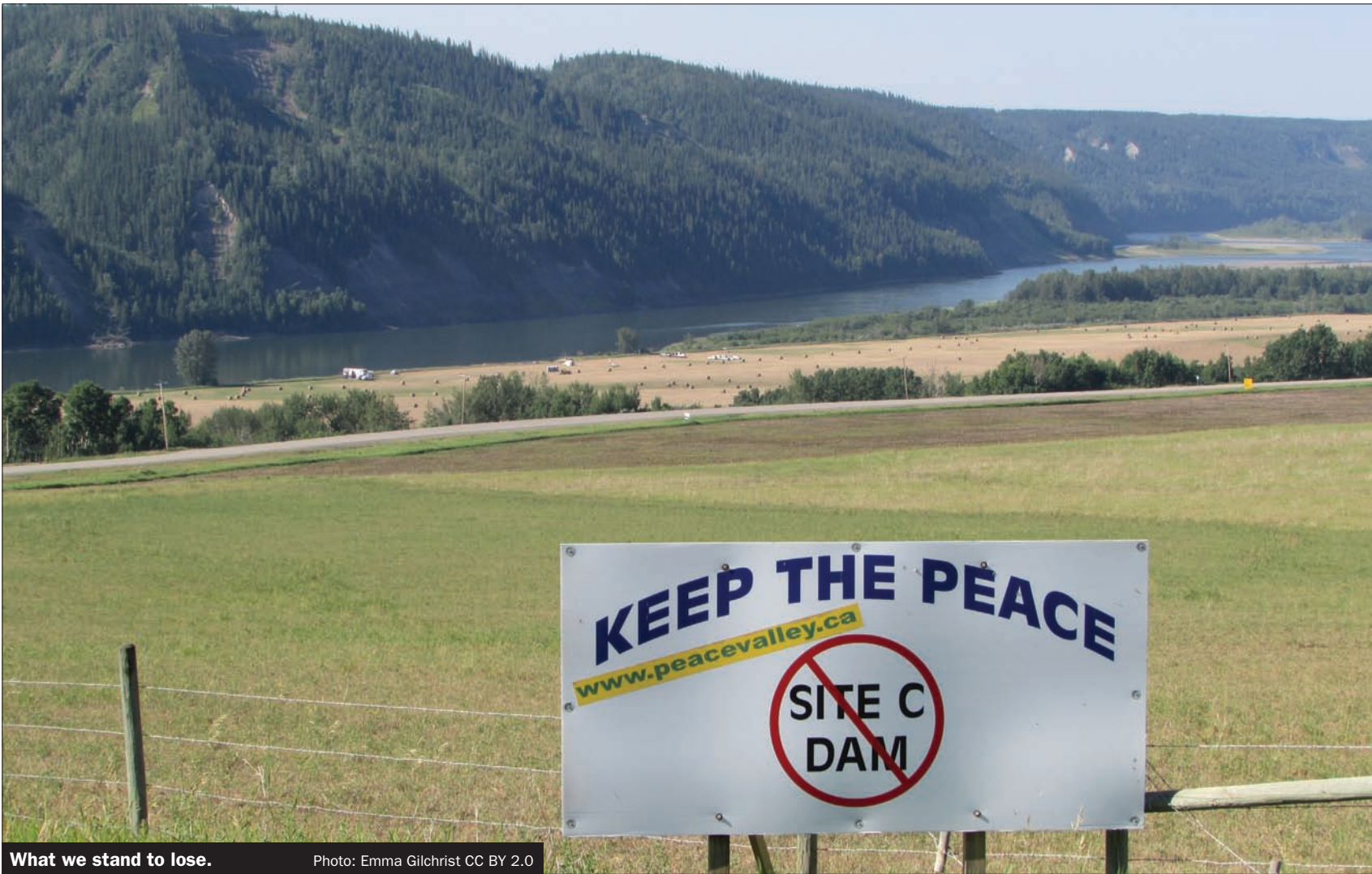
What we stand to lose.

On top of that, the BC Greens are playing just as cynical a game as the other parties. They could have threatened to bring down the government if Site C was approved. The decision on the dam doesn’t need to go to the legislature, but the Greens could have