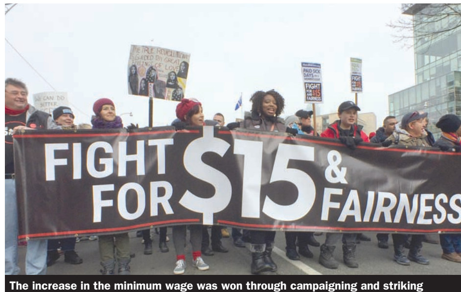
The increase in the minimum wage was won through campaigning and striking

These are cynical attempts to sow fear and confusion among the public. Metro and Loblaw's had profits of $132.4 million and $201 million respectively, increases from the previous year. The OCC and CFIB are ignoring the many studies showing that recent minimum wage hikes have brought positive benefits to