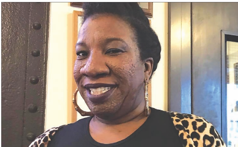
Black feminist Tarana Burke founded #MeToo movement

It was largely due to Black voters – and Black