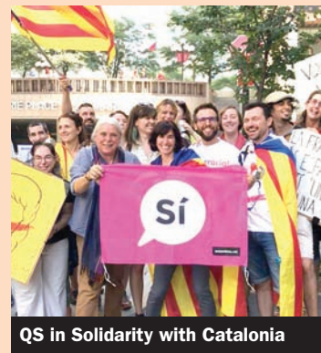
QS in Solidarity with Catalonia

As one QS member said: "Until last night I wasn't sure why I felt like a supporter of Quebec independence. I don't support any kind of Quebec identity. But then I heard from our speakers from Catalonia: it's about what kind of society we want, and the one we are in is broken."