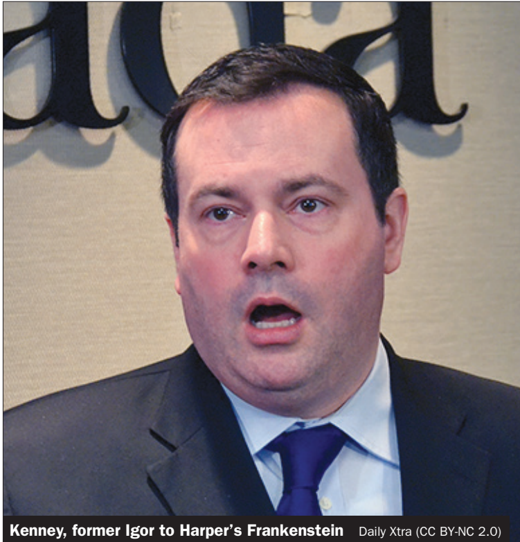
Kenney, former Igor to Harper's Frankenstein

The news is good (for us) or bad (for Manning, Scheer, Kenney, Brown, et al): "... Only 16% of Millennials self-identify with the current conservative brand as compared with 66% who self-identify as liberal, moderate or progressive. The term 'conservative' elicits more negative perceptions than positive ..." The people who came of age under Stephen Harper consider Conservative politicians among the least trustworthy people in the